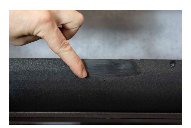
Easy cleanability of machines and workpieces