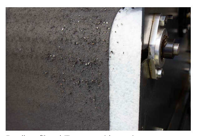
Excellent filterability even with cast iron