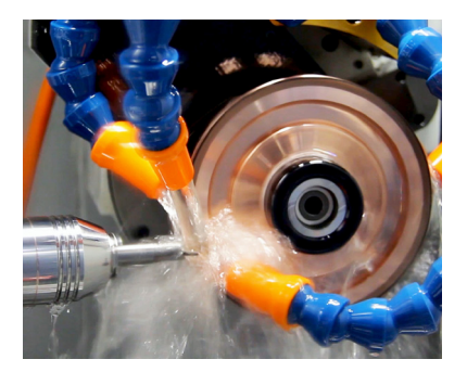
Anca EDG: PCD rotary eroding and carbide tool grinding in one