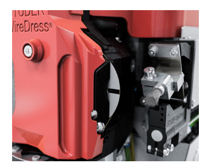
Grinding machines equipped with Studer WireDress