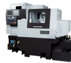
SLIDING HEADSTOCK LATHE WITH B-AXIS SS20MH-III-5AX