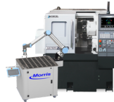
LATHE GENOS L250II WITH MORRIS MACHINE TENDING CART