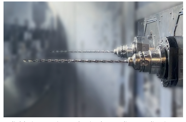
Reliable in practice – also in demanding applications