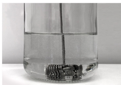
Customary grinding oil