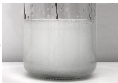
Lots of foam