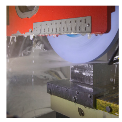
Surface grinding (picture shows Blohm machine)